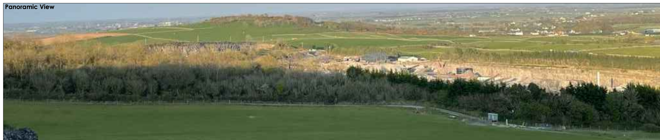
Viewpoint 5 East from Knockmaa.

View East towards subject site from lands to the eastern side of Knockmaa. Whilst this location is not frequented by the public, it presents an open elevated view of the subject site. All other viewpoints on Knockmaa are well screened by existing woodland cover. Operational areas of both quarries are clearly visible from this viewpoint, however although elevated there is no visibility of unauthorised development.